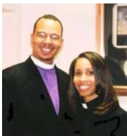
Thank you for your support!