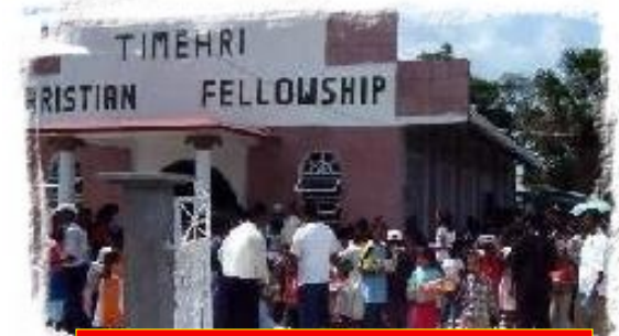
Families waiting in line for food distribution.