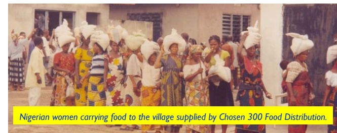
Nigerian women carrying food to the village supplied by Chosen 300 Food Distribution.