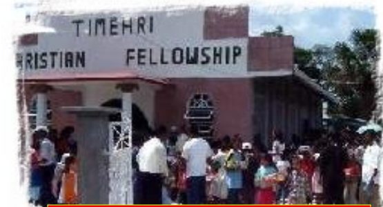
Families waiting in line for food distribution.