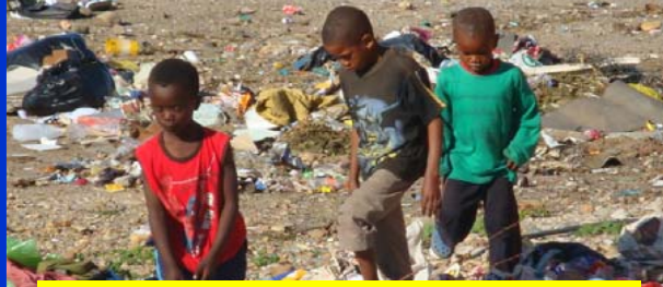
South African children search for food in the garbage.