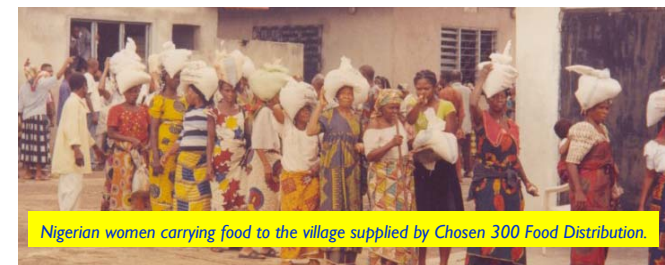
Nigerian women carrying food to the village supplied by Chosen 300 Food Distribution.